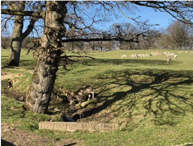
Left and above Ripley.