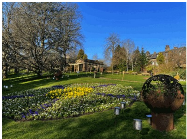
Valley Gardens Photograph by Judith