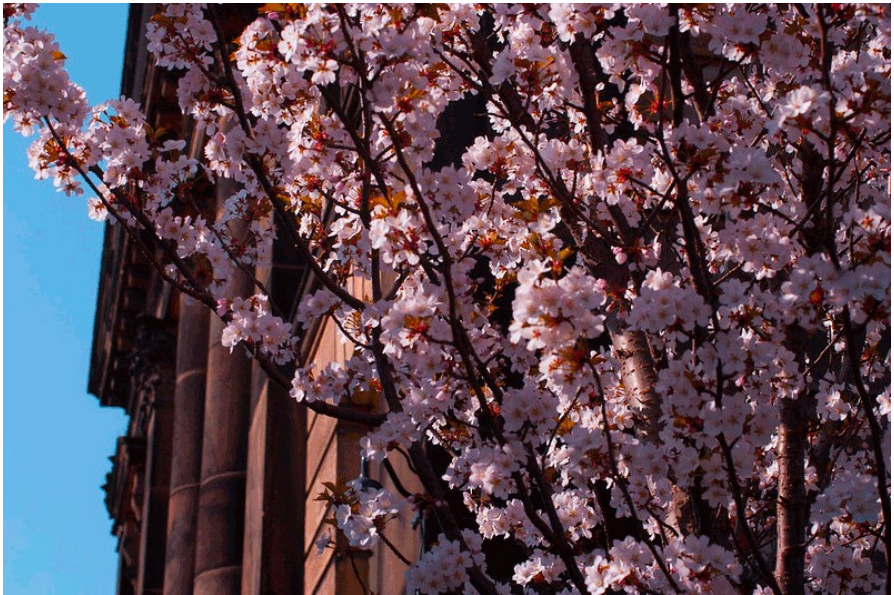
Wesley Chapel in the spring.