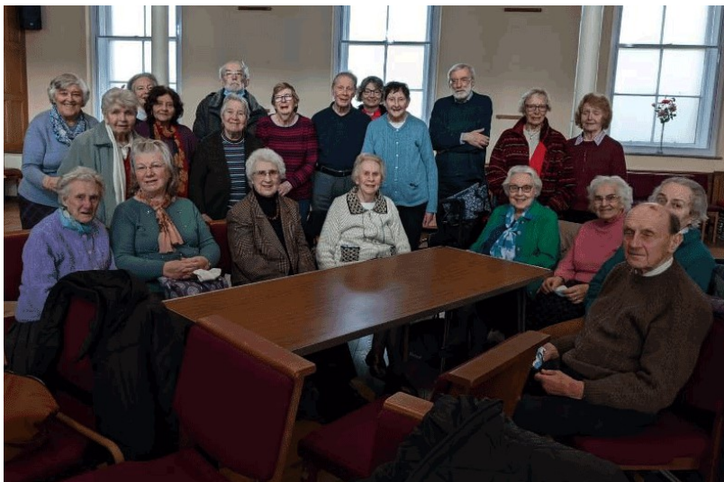
The newly-formed Wesley Fellowship