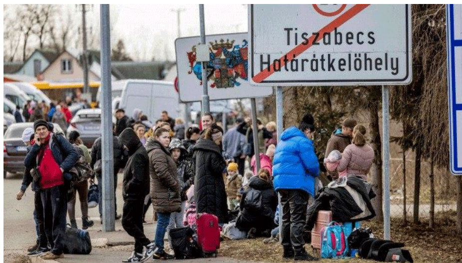
The border crossing into Hungary