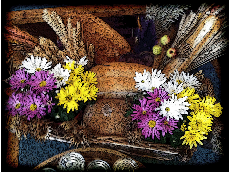
Harvest Festival.