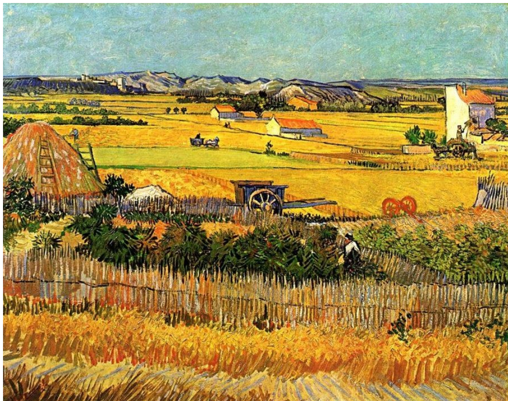
Harvest at La Crau by Vincent Van Gogh