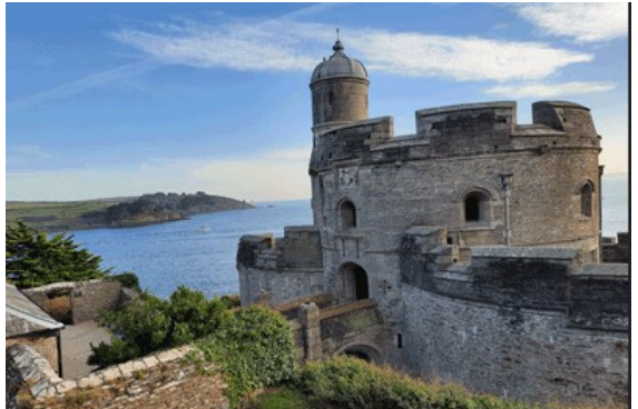
St. Mawes Castle