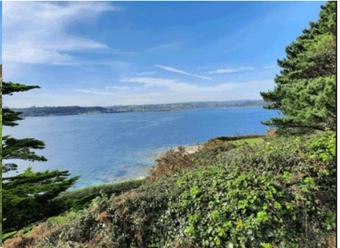
View towards Falmouth