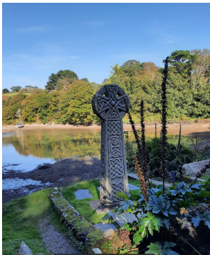
A Celtic cross in the graveyard of St Just in Roseland