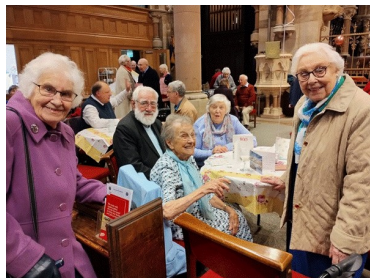
Celebrating at St. Peter's