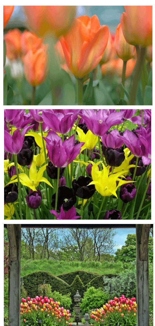
Photographs taken at Harlow Carr Gardens