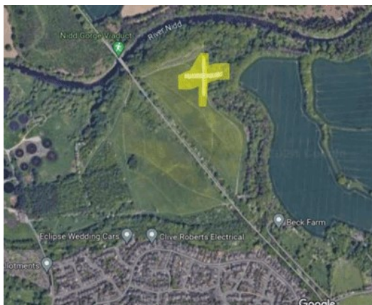
Forest Church venue marked by the yellow cross