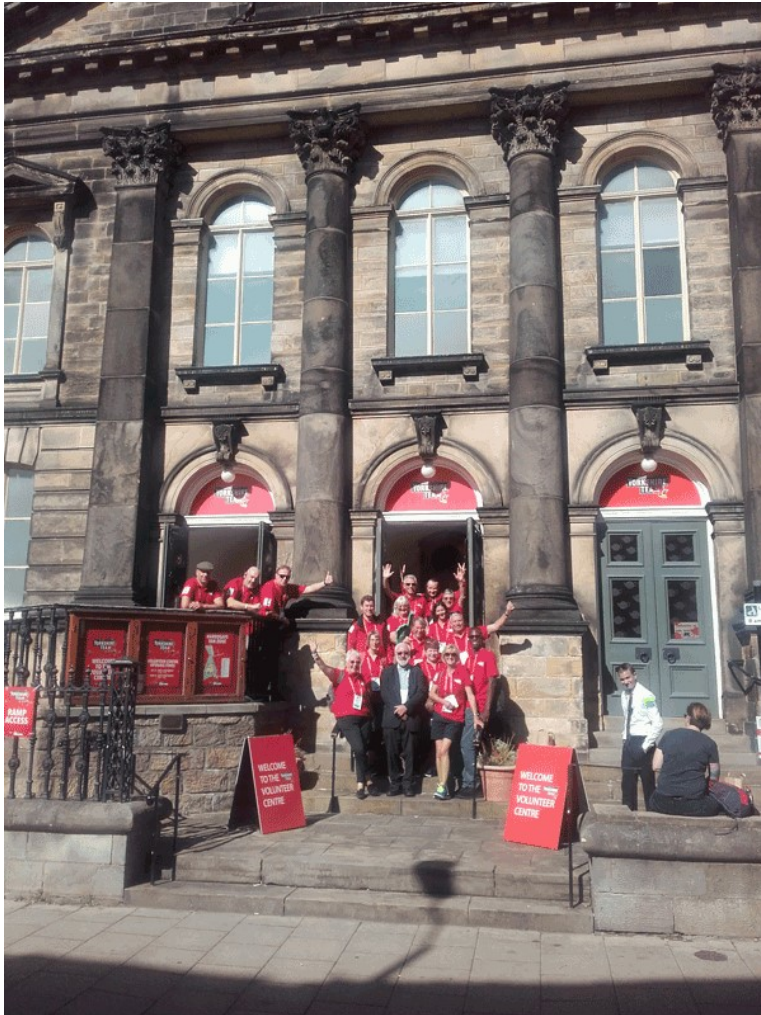
Wesley Chapel Harrogate