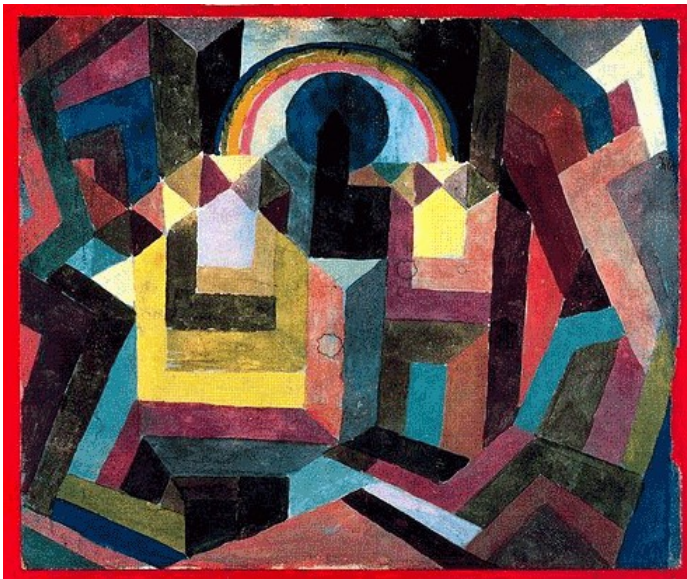
With the Rainbow by Paul Klee. See page 17.

Wesley welcomed the volunteers, who enjoyed using our lovely chapel during the World Cycling Championships. It certainly put Wesley on the map and we were delighted to be part of this prestigious event. (See also front cover).