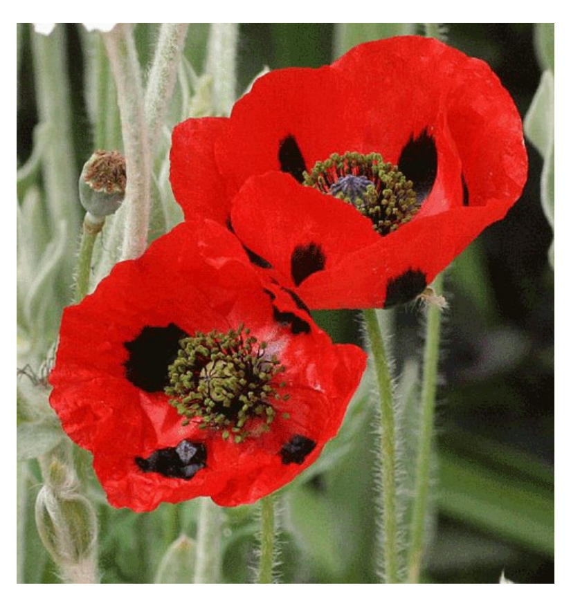
We will remember them