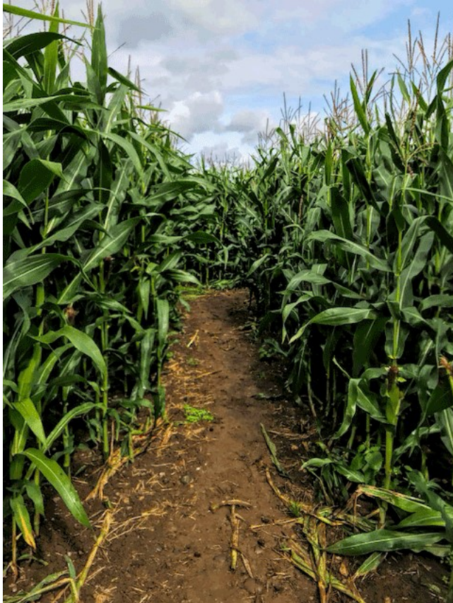
Maize maze.