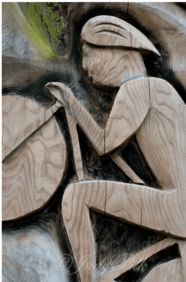
Elm Tree Sculpture in Montpellier, Harrogate. (see p12)