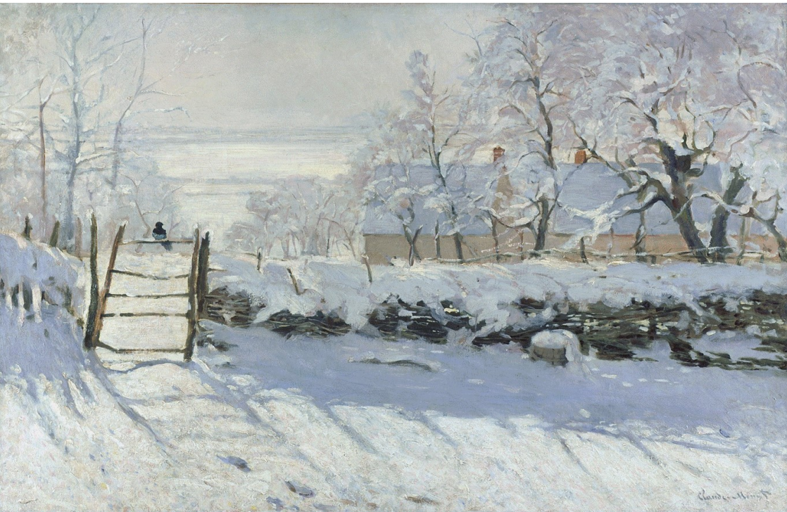
The Magpie by Claude Monet