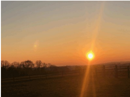
February sunset.

If this belief from heaven be sent, If such be Nature's holy plan, Have I not reason to lament What man has made of man?